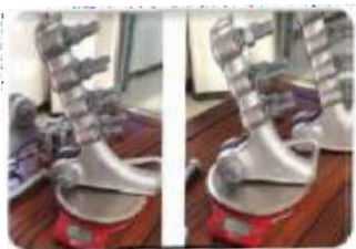
3,4 BOLT CLAMPS