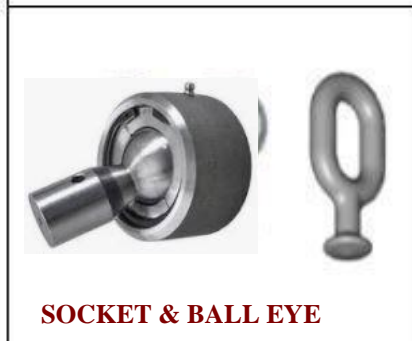
SOCKET & BALL EYE

The product ranges covers the entire Transmission Distribution Systems.