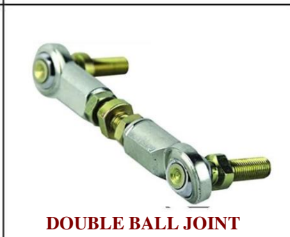
DOUBLE BALL JOINT