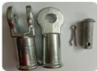
TONGUE & CLEVIS