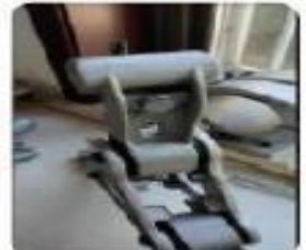
TRIPLE SPACE DAMPNER